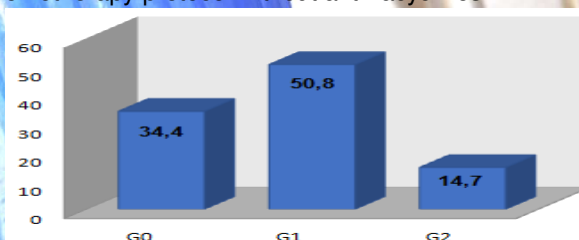
Figure 3: Graduation of alopecia in patients who underwent chemotherapy protocol without anthracyclines.